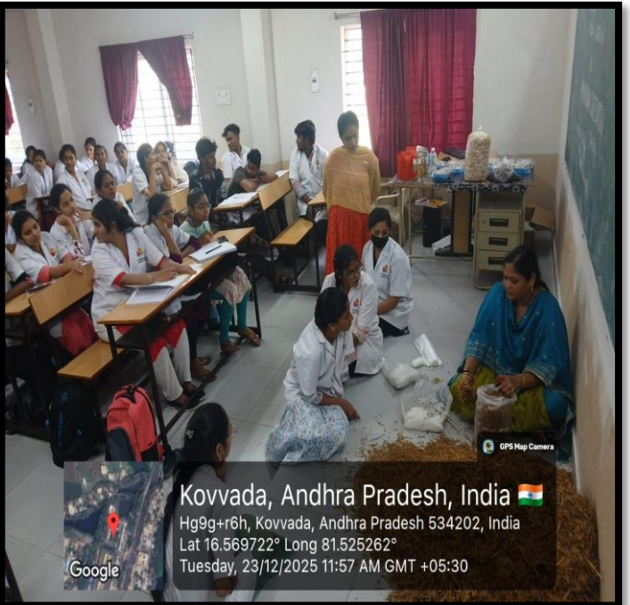
Kovvada, Andhra Pradesh, India 🇮🇳 Hg9g+r6h, Kovvada, Andhra Pradesh 534202, India Lat 16.569722° Long 81.525262° Tuesday, 23/12/2025 11:57 AM GMT +05:30