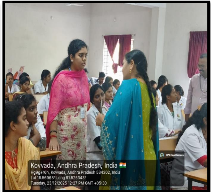
Kovvada, Andhra Pradesh, India 🇮🇳 Hg9g+r6h, Kovvada, Andhra Pradesh 534202, India Lat 16.56968° Long 81.525343° Tuesday, 23/12/2025 12:27 PM GMT +05:30