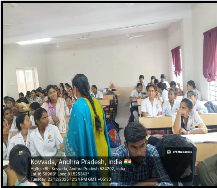
Kovvada, Andhra Pradesh, India 🇮🇳 Hg9g+r6h, Kovvada, Andhra Pradesh 534202, India Lat 16.56968° Long 81.525343° Tuesday, 23/12/2025 12:24 PM GMT +05:30